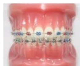
Ideal position Gap = 1-2mm from the side and front