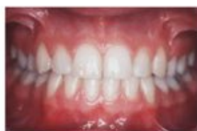
At start of treatment Gap = 5-6mm

For patients undergoing routine orthodontic treatment, the aim is to achieve an ideal bite where the upper front teeth are 2-3mm ahead of the lower front teeth when biting together and there is approximately 1/3 rd vertical overlap of the lower incisors, as shown in the following photographs: